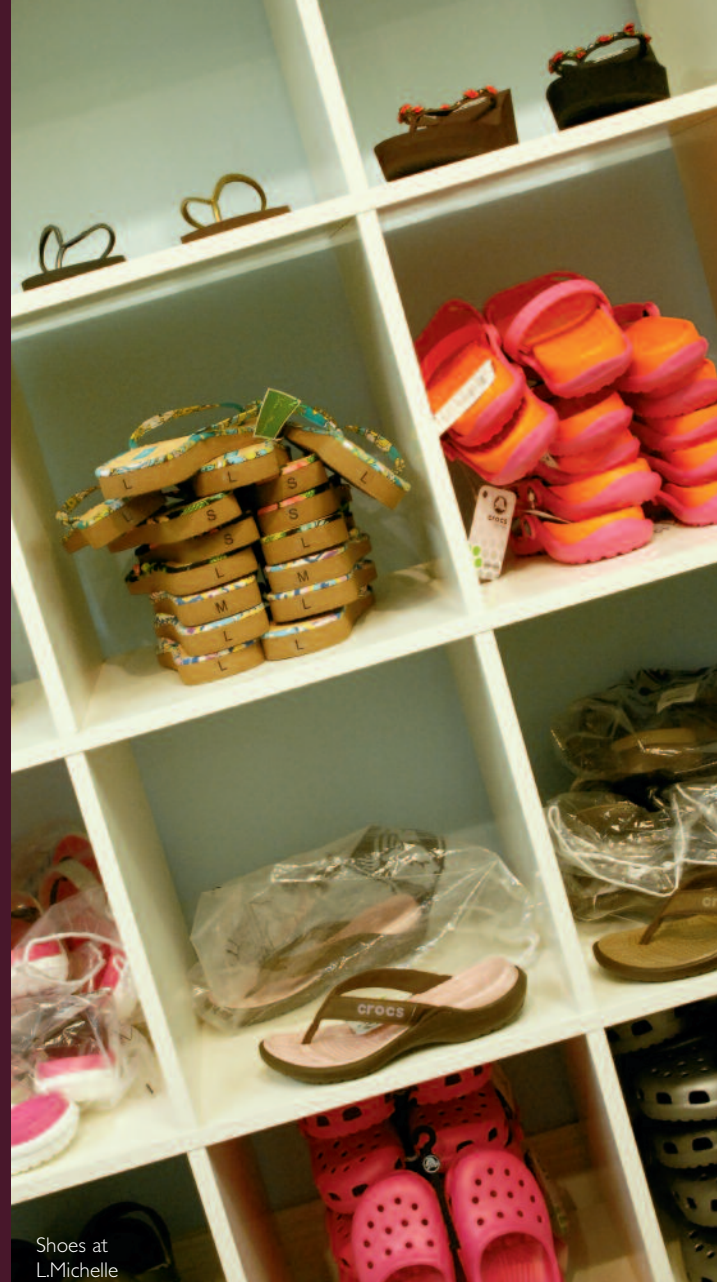
Shoes at L.Michelle

selection of stylish threads as well as accessories like handbags, jewelry and Crocs. The ballet Croc is a feminine alternative to the traditional closed-toe model, and L.Michelle carries thong and sandal styles as well.