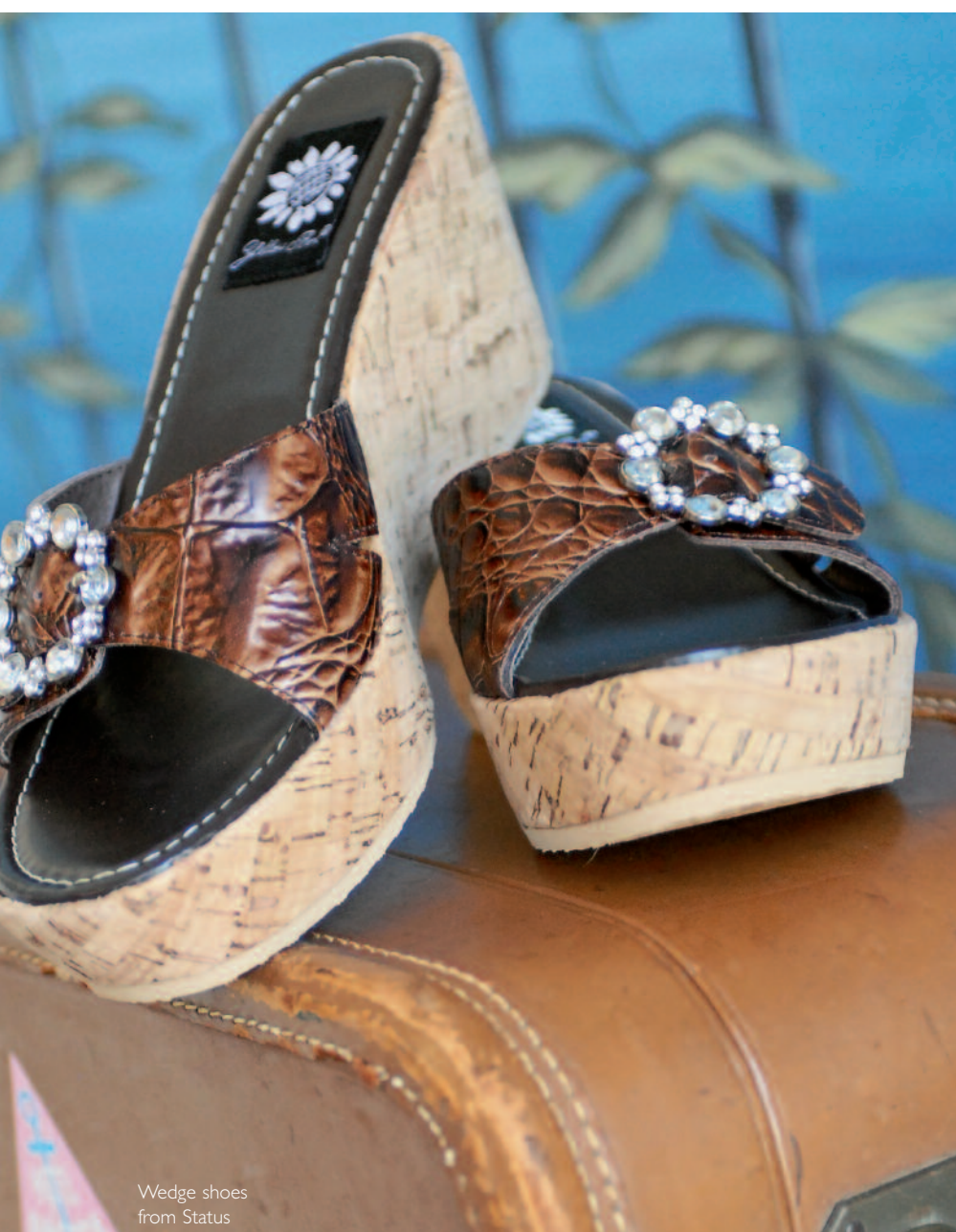
Wedge shoes from Status