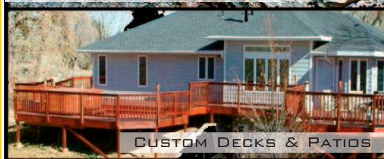
CUSTOM DECKS & PATIOS