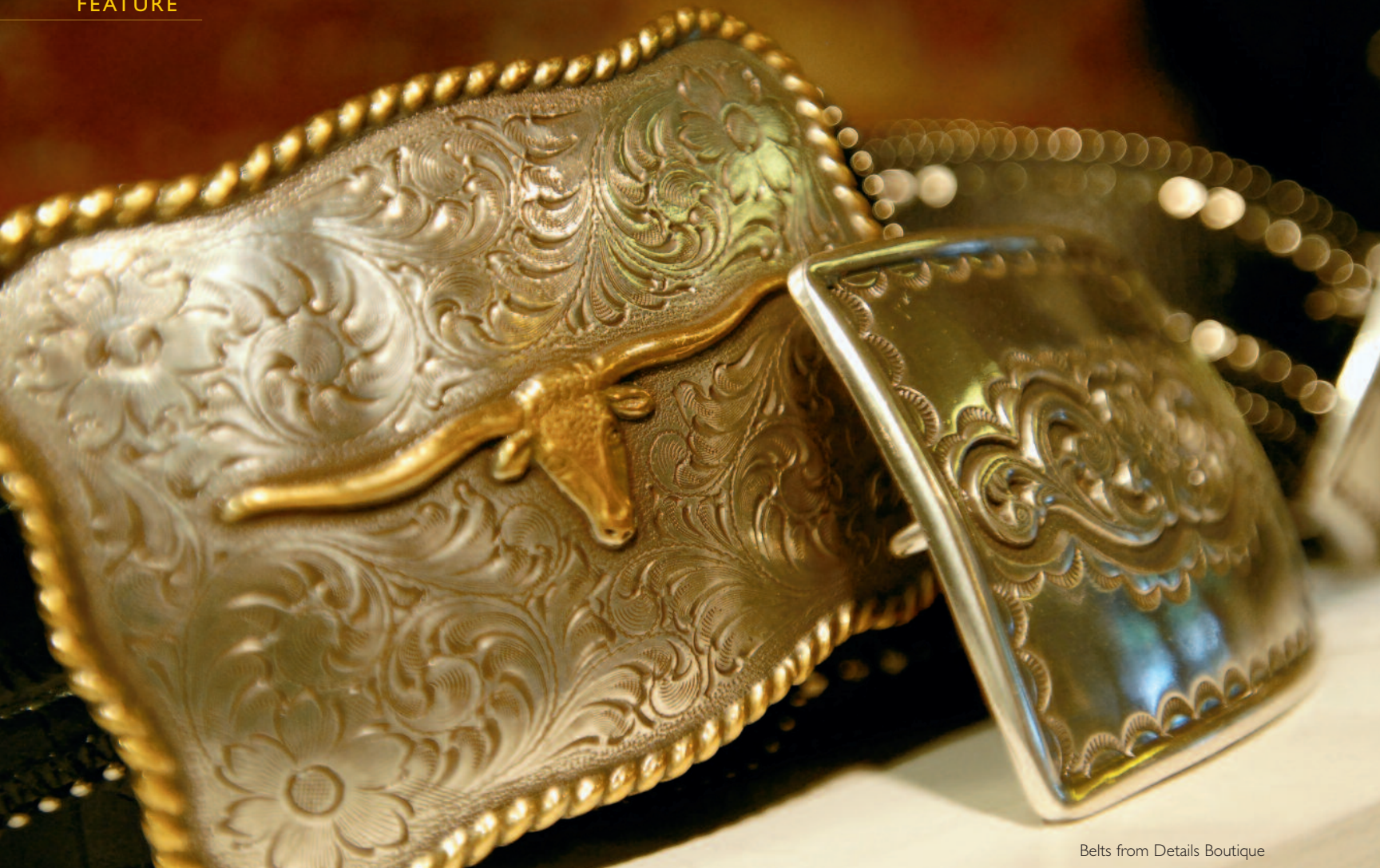
Belts from Details Boutique