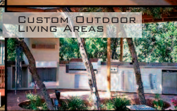
CUSTOM OUTDOOR LIVING AREAS

CALL 404-754-1085 FOR A CONSULTATION WITH OUR PROJECT MANAGER